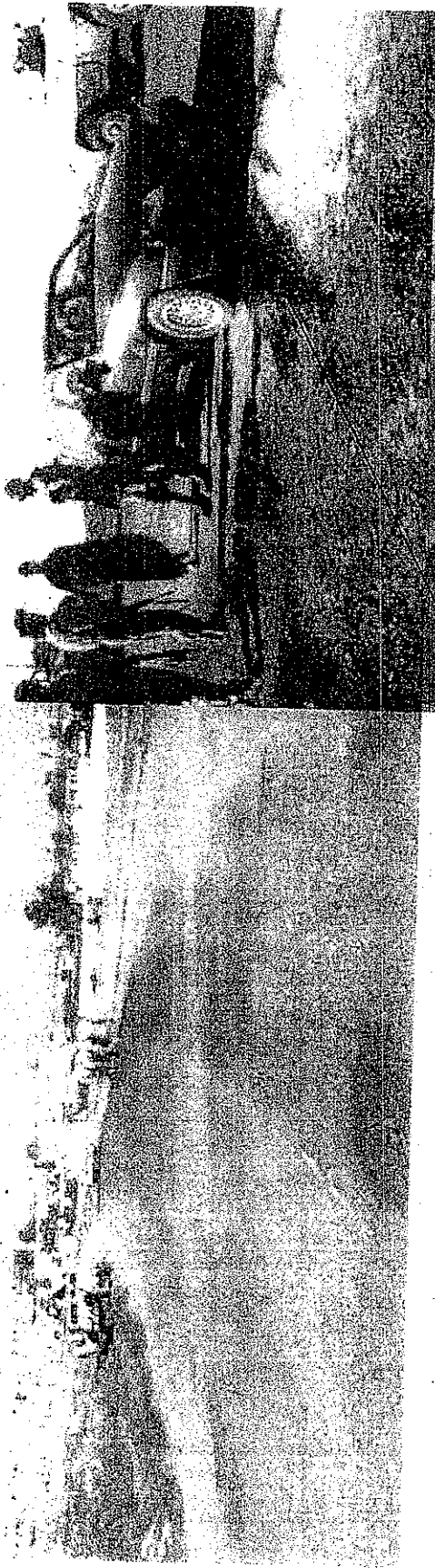
Picture 1 shows approximate location of vehicle when warning shot was fired (looking north on [REDACTED])