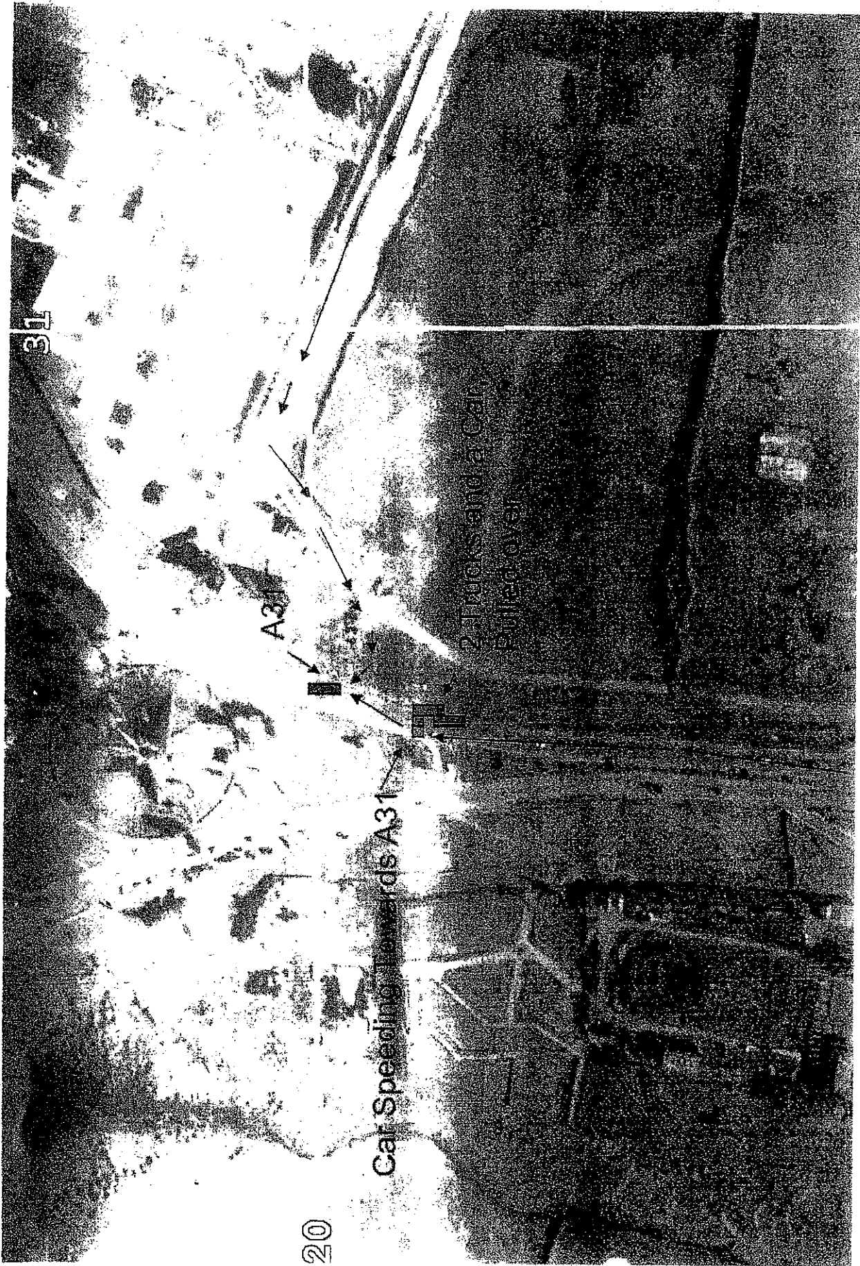
A31 just came onto the road. The LN car speeding towards them drove around a car and two trucks. Physical hand/arm signals and verbal shouts were ignored. Three shots were fired by [redacted] striking the driver in the neck, chest and finally the shoulder. The vehicle then impacted A31 on the left rear. The LN, Kalif Salih, was taken to the CSH on LSA Diamondback.