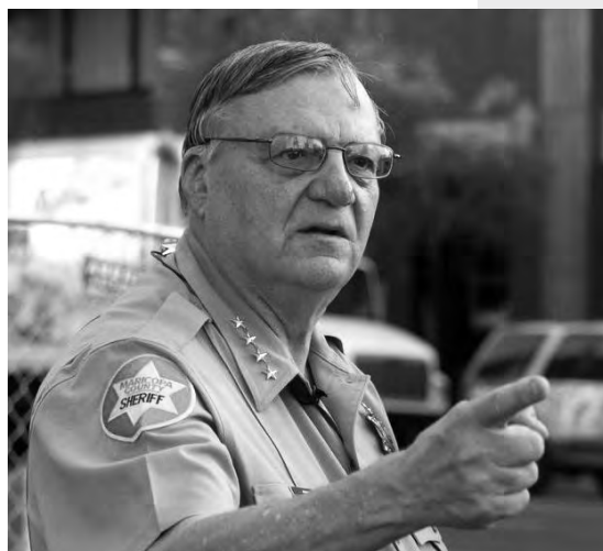
Maricopa County Sheriff Joe Arpaio has received local, national, and international attention for engaging in a broad campaign to intimidate and paint as “illegal” the entire Latino community through unjust traffic stops, neighborhood sweeps, raids and other egregious practices. Immigration protest in Phoenix, Arizona. Photo courtesy of Willie Stark; 2007.

Pursuant to a 2006 settlement agreement in a class action lawsuit brought by the ACLU, the Arizona Department of Public Safety (DPS) is required to collect traffic stop data. 231 An April 2008 report released by the ACLU of Arizona analyzing the first year of data confirmed the prevalence of racial profiling in the state, revealing that African American and Latino drivers were 2.5 times more likely than white drivers to be searched after being stopped by the highway patrol, and Native