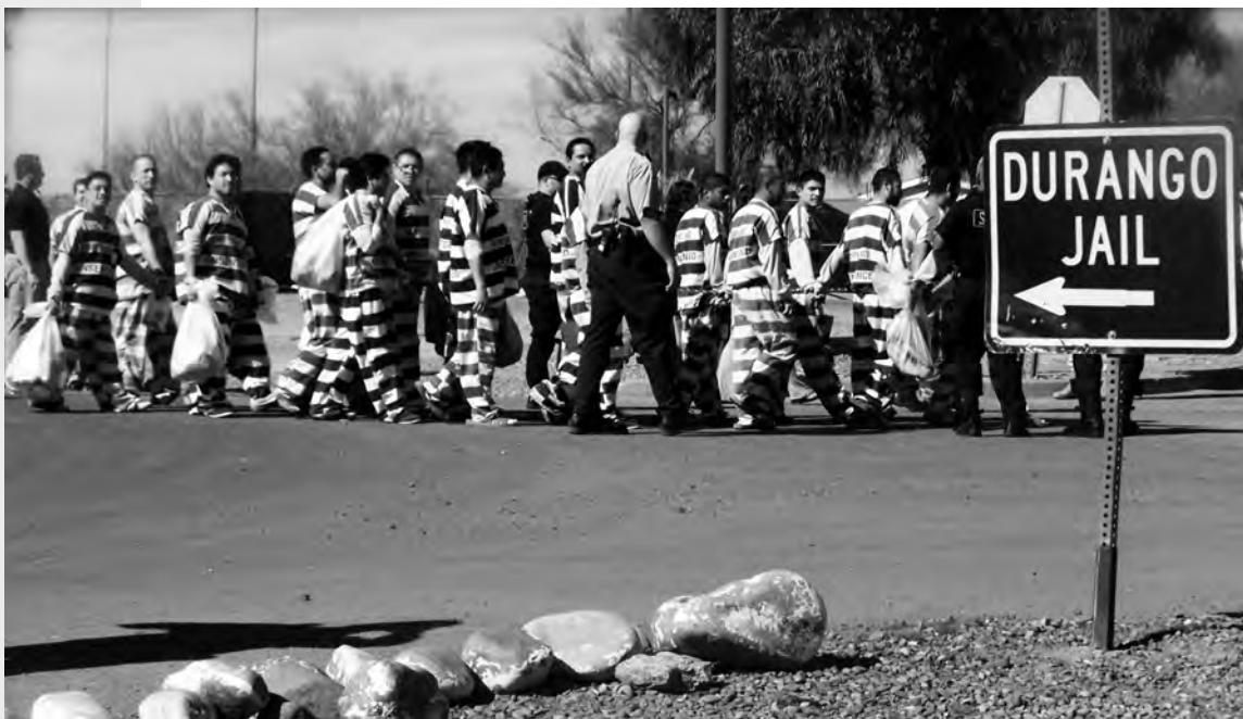
Maricopa County Sheriff Joe Arpaio marched more than 200 almost exclusively Latino inmates, who he claimed were “illegal immigrants” (in fact some of them were legal residents), in chain gang formation from Durango jail to Maricopa County’s Tent City jail. Before the march, Arpaio contacted the media, ensuring that the inmates would be publicly shamed. February 2009.

direction of Joe Arpaio, has received local, national, and international attention for its practice of descending upon neighborhoods with high Latino populations and stopping cars for minor traffic violations in order to investigate the immigration statuses of the drivers and passengers. 235 In April 2008, in the most controversial of the neighborhood sweeps, Sheriff Arpaio saturated a small town of approximately 6,000 Yaqui Indians and Latinos outside of Phoenix with more than one hundred deputies, a volunteer posse, and a helicopter for two days, stopping residents and chasing them into their homes. 236 In the end, nine undocumented immigrants were arrested. 237 The community was so scarred by the event that families are still terrified to leave their homes when they see the Sheriff’s patrol cars. 238 The Sheriff has also begun to conduct raids on area businesses that employ Latino workers. These actions have