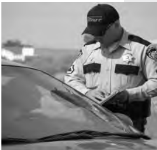
Montana Vista, Texas is a small community of mixed-status families where the local Sheriff's Department has terrorized community members. ACLU and local volunteers documented local human rights violations and took this photo as the Sheriff's Deputy questioned a Latino driver.

The U.S. government should act swiftly to implement the Special Rapporteur's recommendations.