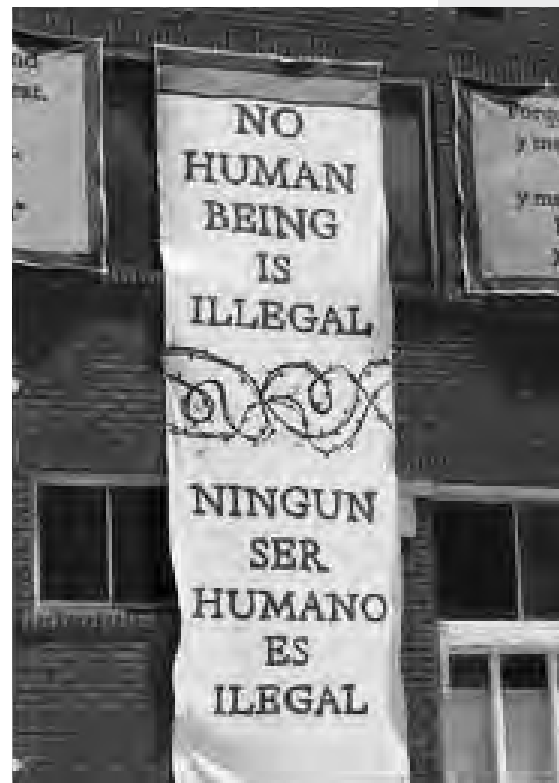
Banner flown in El Paso, Texas to protest racial profiling of immigrants. June 2006.

Since September 11, 2001, new forms of racial profiling have affected a growing number of people of color in the U.S., including members of Muslim, Arab, and South Asian communities. The Obama administration has inherited a shameful legacy of racial profiling codified in official FBI guidelines and a notorious registration program that treats Arabs and Muslims as suspects and denies them the presumption of innocence and equal protection under the law. As noted by Rep. John Conyers, “Since September 11, our nation