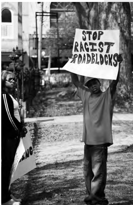
Protestors rally against racial profiling in Canton, Mississippi. March 2008.

Indeed, prosecutions for racially discriminatory police misconduct are the exception rather than the rule. The U.S. government cites to over 400 convictions obtained for "criminal misconduct" by public officials over almost a decade in a country with thousands of law enforcement agencies. 62 This represents a mere "drop in the bucket," in light of U.S. DOJ statistics indicating