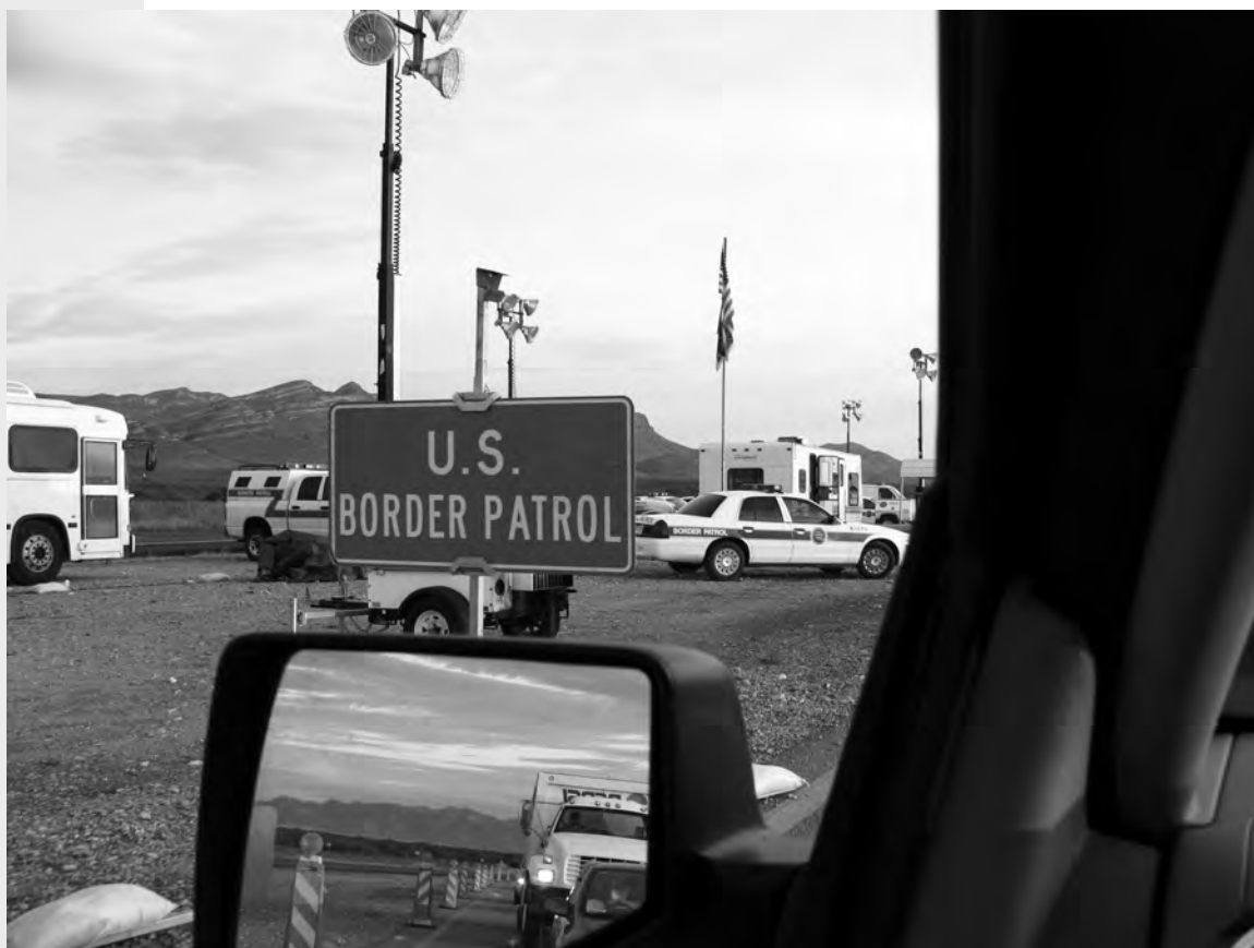
U.S. Border Patrol in Arizona. August 2008.

Since at least 2005, a succession of border security efforts have been created and funded with the stated goal of keeping Texans “safe.” 383 These efforts have consistently been based on the premise that decreasing criminal activity in the border region would protect all Texans. However, most, if not all, of these efforts have resulted in the use of racial profiling techniques by local law