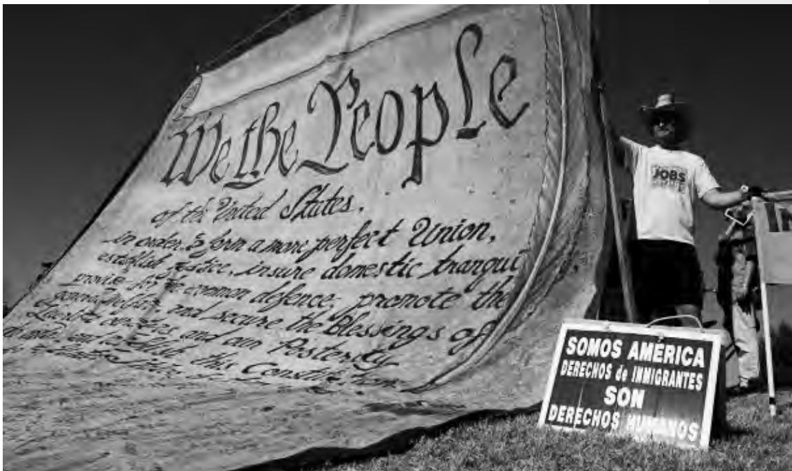
March to End Racial Profiling and Stop the Raids, Phoenix, Arizona. February 2009.

racial profiling . . .” 24 Recently, Attorney General Eric Holder stated that ending racial profiling was a “priority” for the Obama administration and that profiling was “simply not good law enforcement.” 25 In 2005 and in 2007, then-Senator Obama cosponsored ERPA. 26 The Obama administration now has the opportunity to bring the weight of the executive branch in support of the passage of ERPA as the passage of this legislation is a crucial component in a more comprehensive approach to addressing the intractable problem of racial and ethnic profiling and discrimination. The ACLU and the Rights Working Group call upon the Obama administration to make good on these promises and improve upon the disappointing record of the past eight years. The U.S. government must take urgent, direct, and forceful action to rid the nation of the scourge of racial and ethnic profiling and bring the U.S. into compliance with its human rights obligations under this Convention.