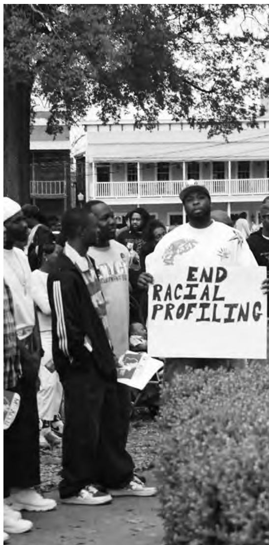
Protestors rally against racial profiling in Canton, Mississippi. March 2008.

In May 2006, South Charleston, West Virginia city police stopped and searched a young African American driver on the pretext that he did not use his turn signals as required. 402 The policeman had followed the young man for about two miles from a 7-Eleven parking lot where he had stopped to observe another traffic stop of an acquaintance. The young man's refusal to consent to a search of his vehicle led to his roadside strip-search in broad daylight in addition to a search of his vehicle. Neither produced contraband or illegal materials. The ACLU of West Virginia filed a suit, which argues that racial profiling motivated the incident, on behalf of the young man. 403 The case is pending.