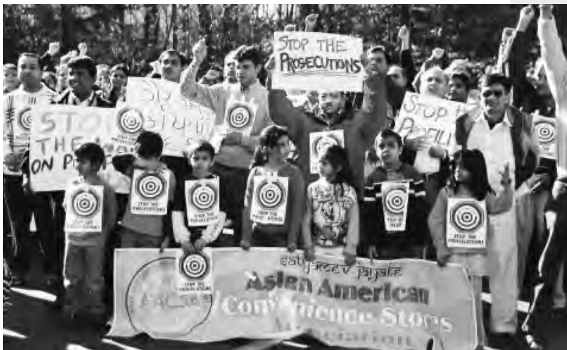
“Operation Meth Merchant” racially profiled Indian immigrant merchants and shop workers in northwest Georgia. As a result of this unjust targeting, Indian immigrant workers and their communities were economically and psychologically devastated and families were torn apart. January 2006.

deputized law enforcement with the opportunity to check a detainee’s immigration status and, in the cases of an undocumented detainee, turn that individual over to ICE. In an apparent attempt to fast-track the deportations of immigrants and expedite Gwinnett County’s entrance into a 287(g) agreement, the Gwinnett County Sheriff’s Department partnered with ICE to investigate the immigration statuses of everyone held at the county jail over a 26-day period in January and February 2009. Nine hundred and fifteen foreign-born individuals were flagged for deportation by ICE officials, 226 of whom were charged with driving without licenses, the most prevalent offense in the group. 280