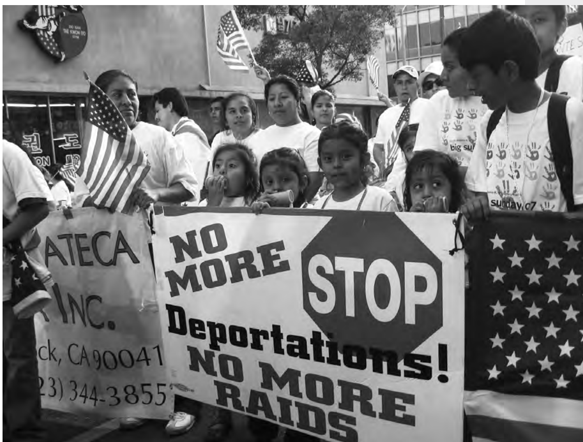
Vigil and Procession for Justice and Civil Rights, Los Angeles, California. Photo courtesy of Korean Resource Center 민족학교 via Flickr with Creative Commons licensing; May 2007.

gender of motorists in all traffic stops, that this data be analyzed, and that annual reports be made public. 314