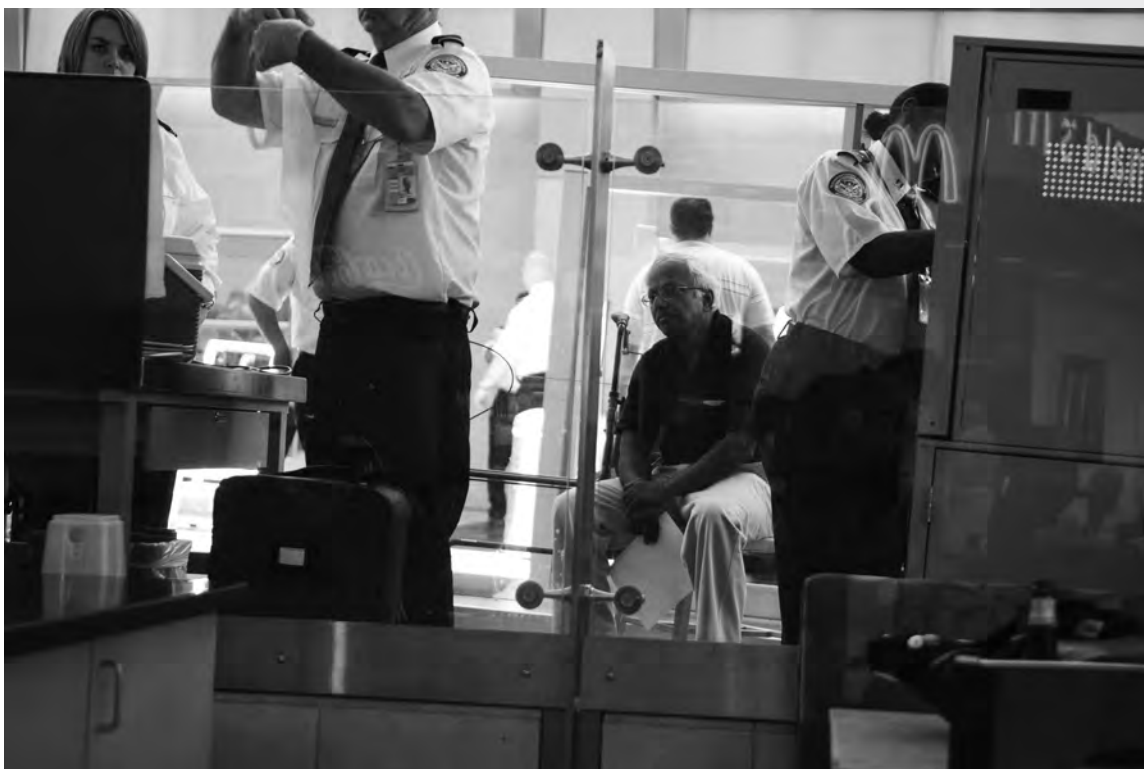
Muslims, Arabs and South Asians are frequently pulled aside at airports and border crossings, forced to submit to lengthy and humiliating searches, and questioned about their faith, friends, family, and political opinions. Photo courtesy of vissago via Flickr with Creative Commons licensing; August 2008.

to see family, Muslims, Arabs, and South Asians are forced to submit to lengthy and humiliating searches and have their families, business contacts and personal papers subject to governmental scrutiny. 170 As a result, business travelers have reduced their trips abroad and individuals have left personal papers, cell phones, and laptops at home to avoid the intensive and unwarranted searches by CBP.