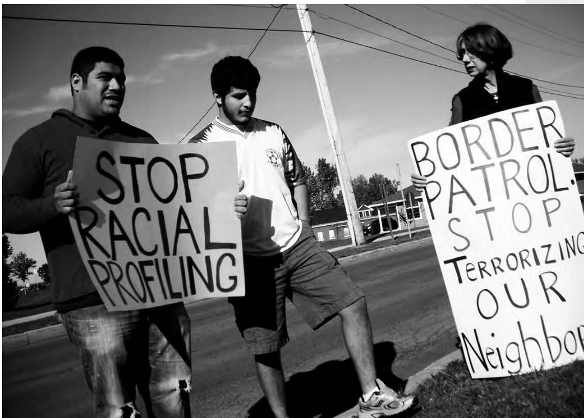
Protestors in Oswego, New York object to border patrol practices following a raid. October 2008.