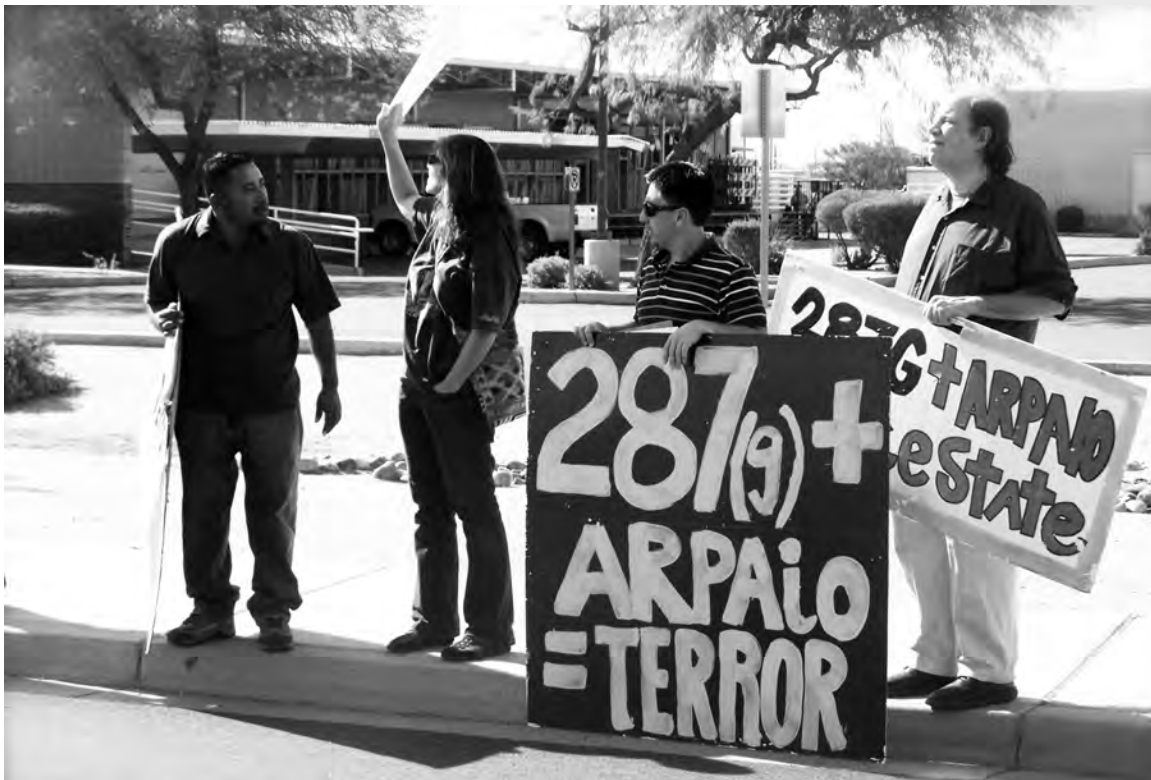
Community members outside the Durango jail in Phoenix, Arizona, protest the 287(g) program and the actions of Sheriff Joe Arpaio, which have devastated Latino communities. February 2009.